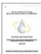
Groundwater Characterisation Report (2004)

Within the CIS framework, the working group on Groundwater Body Characterisation and monitoring was established in order to exchange information and experiences on groundwater issues covered by the WFD. This was achieved through a series workshops and the development of technical reports gathering the participants experiences. Three reports were produced during this period. These reports summarise the technical information already provided in other guidance documents in relation to groundwater body characterisation, groundwater risk assessment and groundwater monitoring. Each document includes examples of practices presented at the national, regional and Pilot River Basin levels by participants.